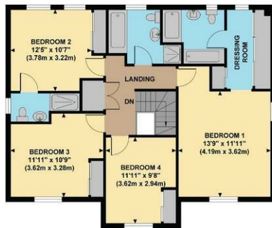
FIRST FLOOR GROSS INTERNAL FLOOR AREA 887 SQ FT