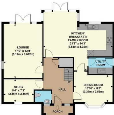
GROUND FLOOR GROSS INTERNAL FLOOR AREA 901 SQ FT

Approximate Gross Internal Area 2072 sq ft / 192.50 sq m